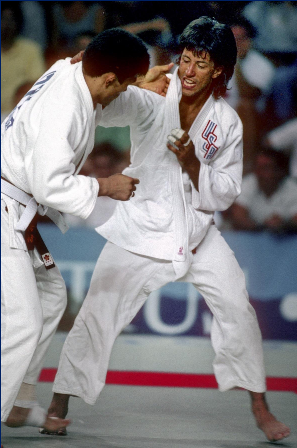
Jason Morris (USA) squares off against Hidehiko Yoshida (JPN) in the 78kg Olympic final